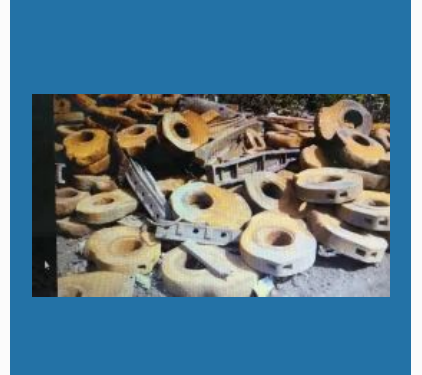
Manganese Steel Scrap