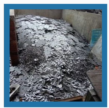
410 Stainless Steel Scrap