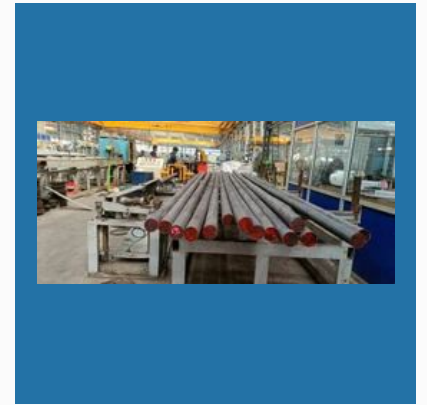
Stainless Steel 304 Round Bar