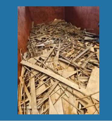
Melting Steel Scrap