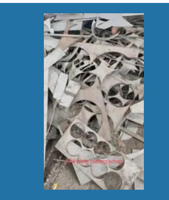
Stainless Steel Plate Off Cuts