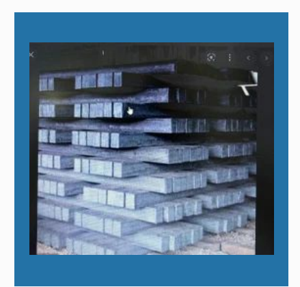
304 Stainless Steel Billet