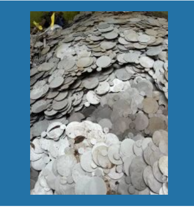
2507 Super Duplex Steel Scrap