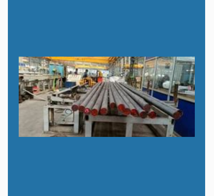
420 Stainless Steel Round Bar