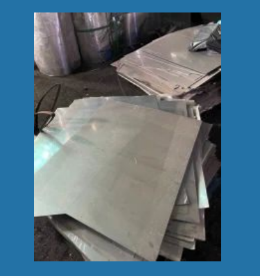
Stainless Steel 304 Sheet Scrap