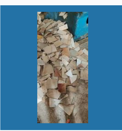
2205 Super Duplex Steel Scrap