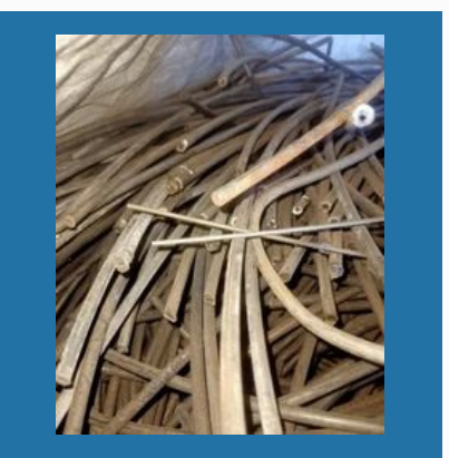
Nickel Alloy Scrap