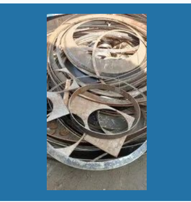
Maraging Steel 250 Scrap