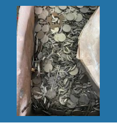
Stainless Steel Plate Cutting Scrap