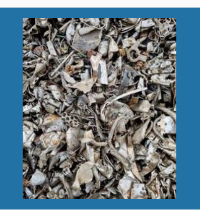
Shredded Steel Scrap