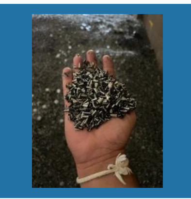
304 Stainless Steel Turning Scrap