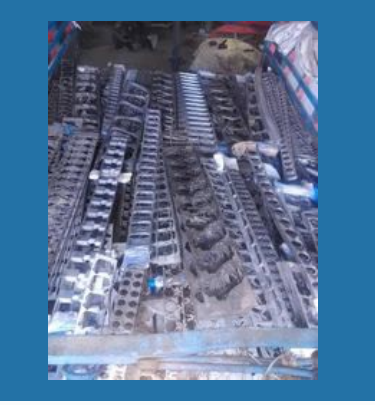
Stainless Steel 409