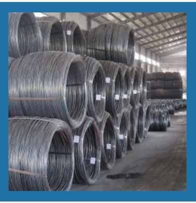
Stainless Steel Wire Rod