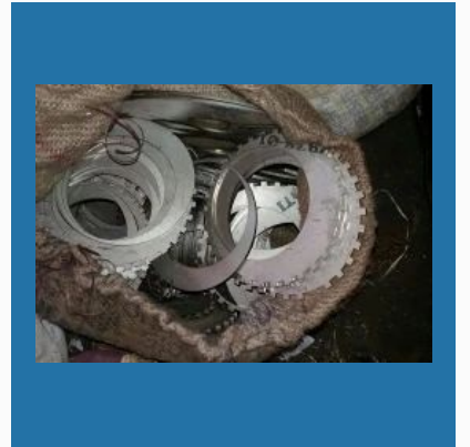
Inconel 718 Scrap