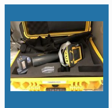
Pmi Testing Service (Metal testing)